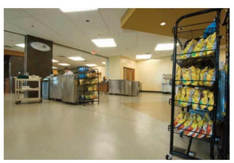
Seamless floors in Palmyra's food service areas are easy on maintenance staff - simple cleaning with no waxing or polishing.